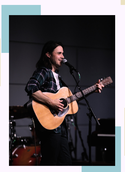
VIP's enjoy an excellent view of the Mainstage. Above: American Idol Winner Kris Allen performs in 2022