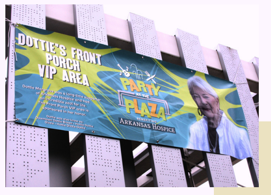
VIP's can relax at Dottie's Front Porch to enjoy all the festival has to offer

Sponsors and donors will be treated to the VIP Experience at Party at the Plaza, which includes a private VIP tent with complimentary food, beer, wine and signature cocktails for the duration of the all-day festival. Lounge in the shade while you take in a lineup of top tier musical acts, or cool off after you tour the Artists on the Avenue Market and Care Fair, and take home complimentary VIP swag from us!