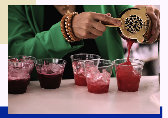
Expertly crafted cocktails, wine, beer and soft drinks are available to all VIPs

THE MISSION of Arkansas Hospice is to enhance the quality of life for those facing serious illness and loss by surrounding them with love and embracing them with the best in physical, emotional and spiritual care